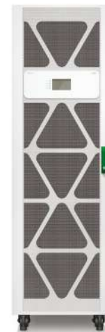
Easy UPS 3M 60-80 kVA UPS with internal batteries