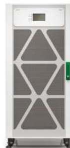
Easy UPS 3M 200 kVA UPS for external batteries