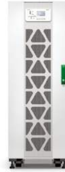
Easy UPS 3S 30-40 kVA UPS with internal batteries