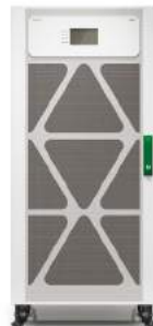
Easy UPS 3M 200 kVA UPS for external batteries