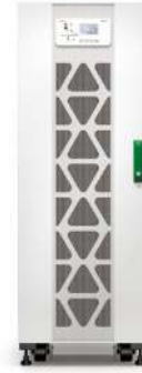
Easy UPS 3S 30-40 kVA UPS with internal batteries