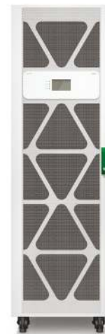
Easy UPS 3M 60-80 kVA UPS with internal batteries