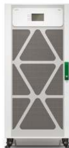
Easy UPS 3M 200 kVA UPS for external batteries