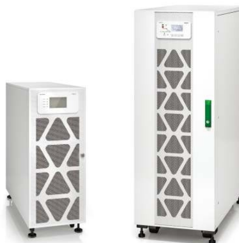
100 kVA Easy UPS 3M for external batteries

**Included with Easy UPS 3M; recommended service option for Easy UPS 3S